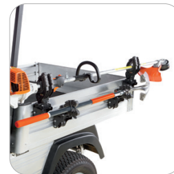
Ratcheting Tool Holder Kit (Upper) & Standard Tool Holder Kit (Lower)