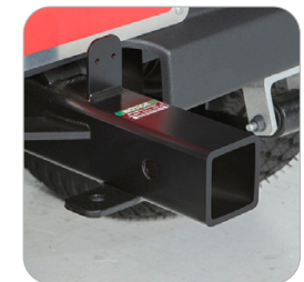
Rear Receiver Hitch