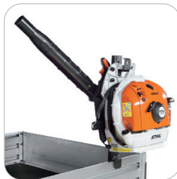
Backpack Blower Rack