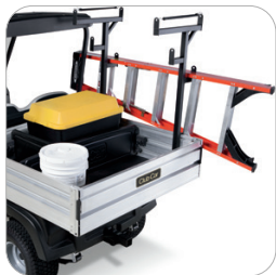
Bed-Mounted Ladder Rack Kit

More accessories are available. Ask your Club Car sales representative for details.