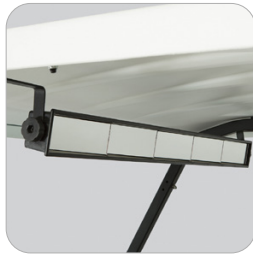
5-Panel Rear View Mirror