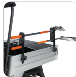
Multi-Tool Holder Kit